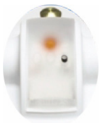
Fig : IG31U Ice Maker Water Filter System

BENEFITS ▪ Reduces scale formation and sediment that cause frequent breakdowns ▪ Improves ice quality ▪ Extends life and reliability of ice machines ▪ Includes Cartridge Life Monitor ▪ Efficient, economical and reliable operation